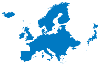
Eurozone and Japan